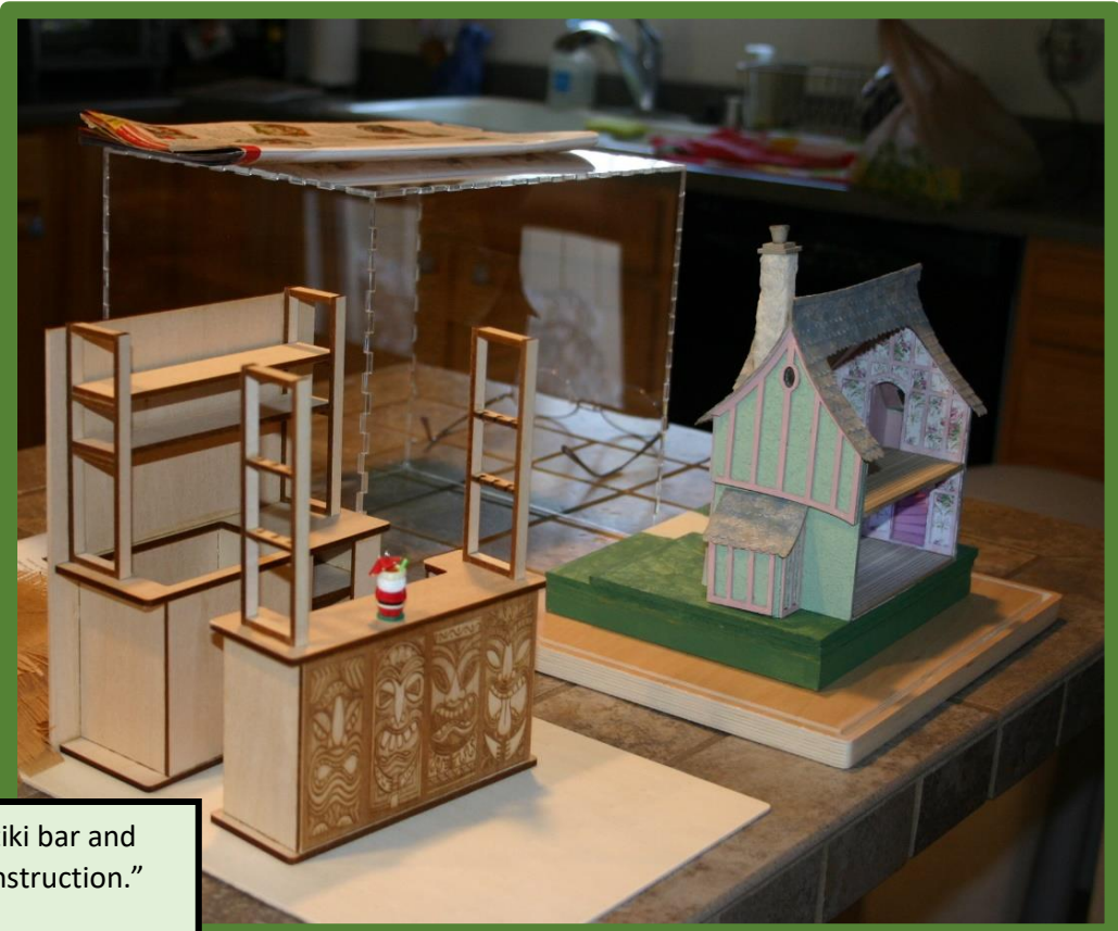
Sample of the NAME DAY tiki bar and Susan's cottage "under construction."