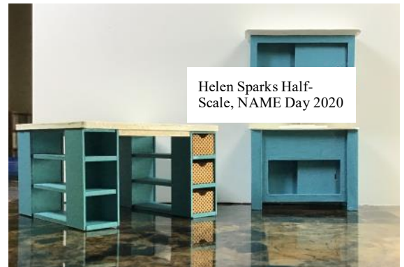
Helen Sparks Half-Scale, NAME Day 2020