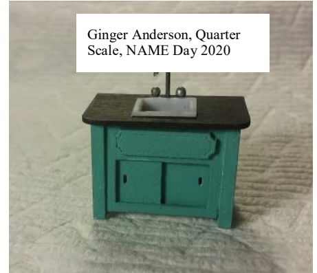
Ginger Anderson, Quarter Scale, NAME Day 2020