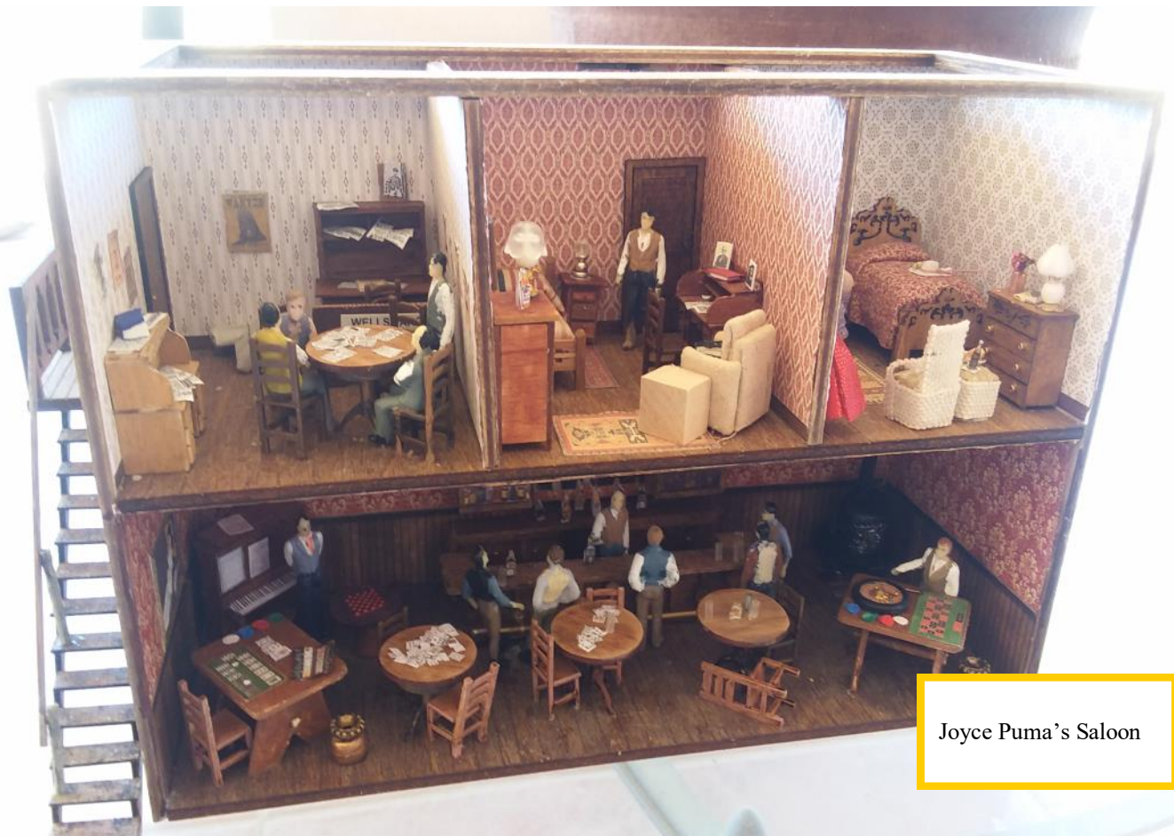
Joyce Puma's Saloon

It is a challenge staying in touch with each other and continue to enjoy creating miniatures, but we are making it work as best as we can!