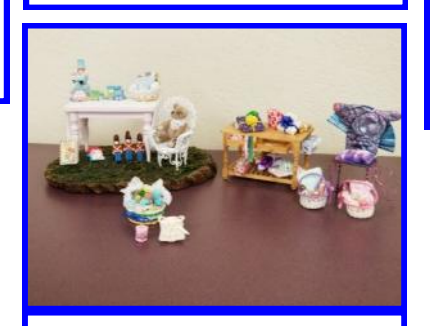
Wicker baskets and Chair by Vegas Airs