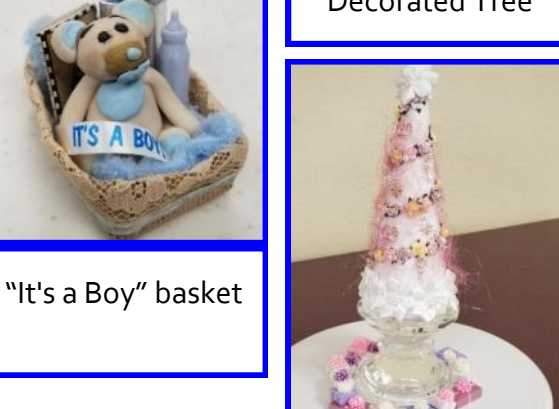
Another Decorated Tree