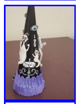
Halloween Decorated Tree