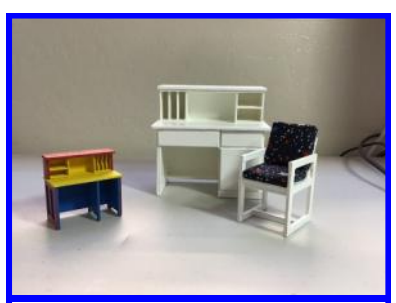
Finished Desks in Inch and Half Inch Scale