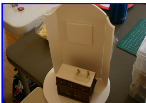
Dome Room Structure scheduled for April.