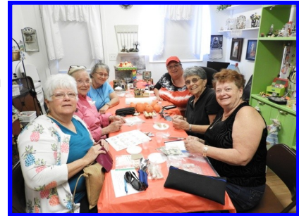
Yuma's NAME Club

The beginning of 2018 has been a very busy time for the Tucson (SAME) club. Members are currently busy working on individual, stand alone, doors which will be displayed later this year at the Community Corner of The Mini Time Machine Museum of Miniatures. The members are also submitting photos of individual completed projects to the museum, in the hope that some of the projects will also be chosen for exhibit by the museum. Space is limited, but it is an exciting to know that some of the club members will have some of their projects on display later this year. Last but not least, although October is a long way off, discussion for the October Tucson show has also started. The theme for the exhibits has already been picked and I will have more information in the next newsletter on the October show.