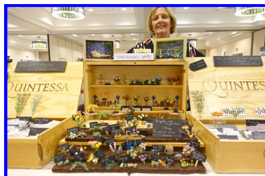
From the Show, February 2018

Well that didn't happen, but the San Diego Miniature Crafters show committee was a bit worried when we changed locations this year. It had long been our goal to find a centrally located venue that was large enough to fit all our dealers on one floor (and was affordable). When we found the Marriott Mission Valley, we got more than we bargained for since they were in the midst of a beautiful renovation of the