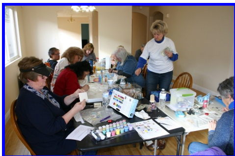
February Meeting of the Albuquerque Mini Makers