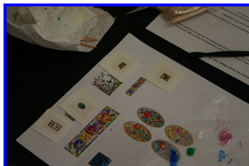
Stained Glass Windows as taught by Susan Pippin