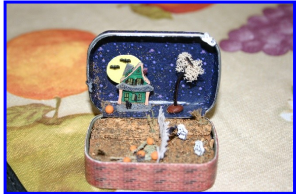
The AMM August Meeting featured a Halloween scene in an Altoids tin.

Best mini wishes to everyone for the coming holidays this year.