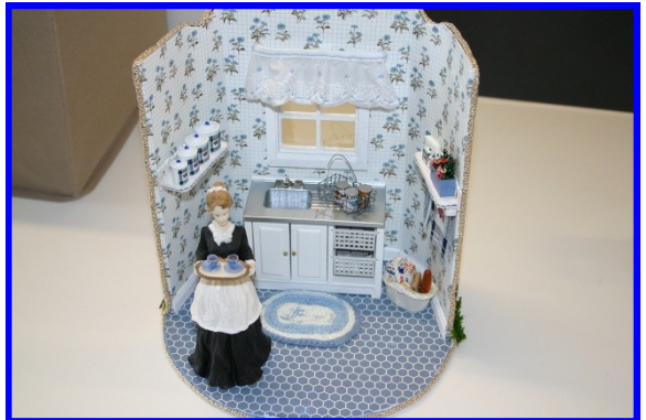
Vignette from the AMM club