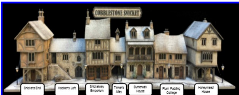
Display of Shops from the San Diego Miniature Crafters